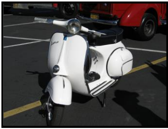
6 – 1973: The Toad's daily driver, just not a very good parker...