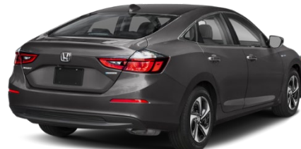
2022 Honda Insight $25,760 - $29,790 | 51-55 City / 45-49 Hwy