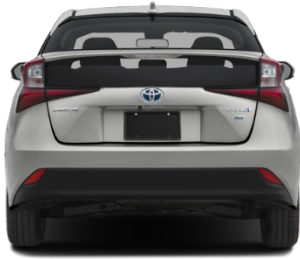
2022 Toyota Prius $24,625 - $32,920 | 51-58 City / 47-53 Hwy