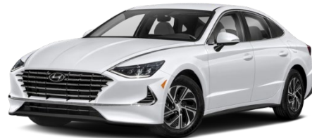
2022 Hyundai Sonata Hybrid $27,200 - $35,550 | 45-50 City / 51-54 Hwy