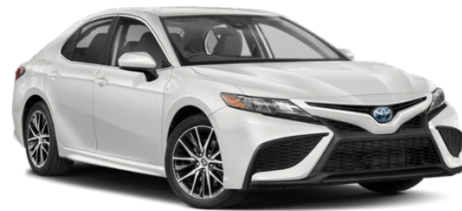
2022 Toyota Camry Hybrid $27,480 - $32,920 | 44-51 City / 47-53 Hwy

Here are a few of the best Hybrids on the market today. Can you tell that they are hybrids?