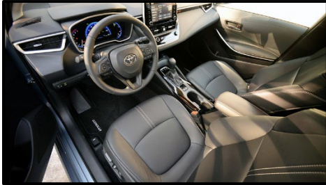
2022 Toyota Corolla Hybrid $23,750 | 53 City / 52 Hwy